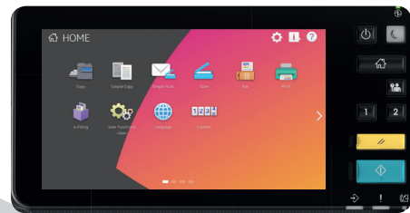
Customised to display up to 18 icons per page and with a different background

Mobile Printing connects these systems with your mobile devices via AirPrint, Google Cloud Print or the Mopria Print Service.