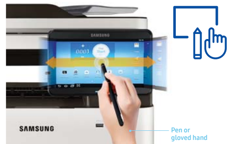
Pen or gloved hand