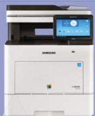
C4060FX (40 ppm)