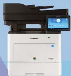
C4062FX* (40 ppm)

*Only available in North and Latin America