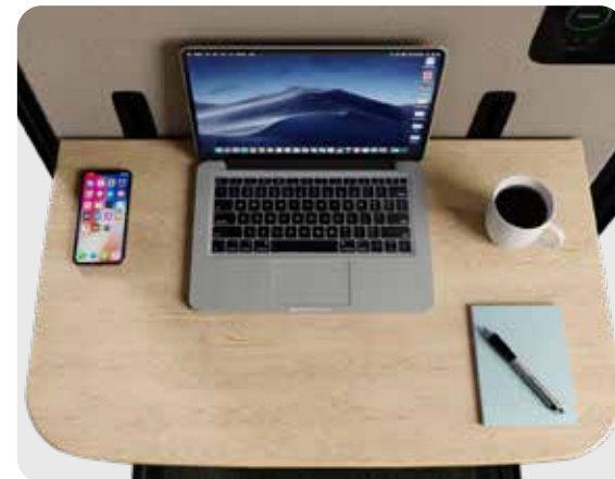
The height adjustable table The height adjustable table provides comfort for all users. The table can be adjusted vertically between 70 cm - 120 cm (27.6 - 47.2 in). The ample surface of the table (76 cm width & 46 cm depth/ 30 in x 18 in) provides space for laptops, personal devices and other work tools.