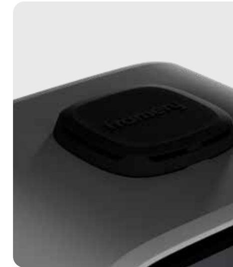
Activated Carbon Filter Keep the air inside Framery One extra fresh and clean and free of odors with an activated carbon filter. The filter removes pollutants from the air with an adsorption process.