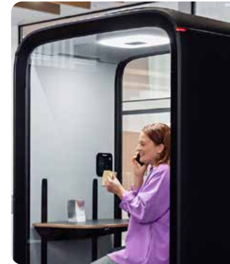
Occupancy light Stepping into the pod, Framery One's occupancy lights will display a red light with 360° visibility to let the office know the pod is in use.