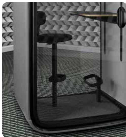
Height adjustable seat The height adjustable seat has two footrests for comfortable working. The height can be adjusted vertically between 59 cm - 85 cm (23.2 in x 33.5 in).