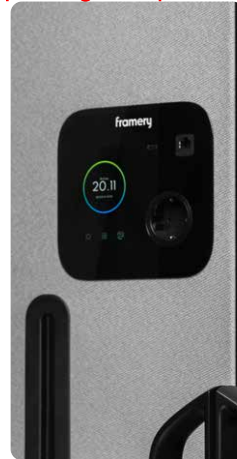
UI Panel Adjust airflow & brightness of the light according to your own preference from the touchscreen. See both the availability of the pod and/or book a reservation (by using the optional calendar integration) from your own laptop or phone or just walk in and the pod reserves itself automatically for you. Integrated 4G technology module enables three-way communication between you, the pod and Framery. Whether it's about calendar reservations, pod maintenance, updates or notifications, all matters related to the Framery One pod are handled remotely (digitally). Pod outlets (1 power socket, USB C socket, optional LAN) are located on the UI Panel.