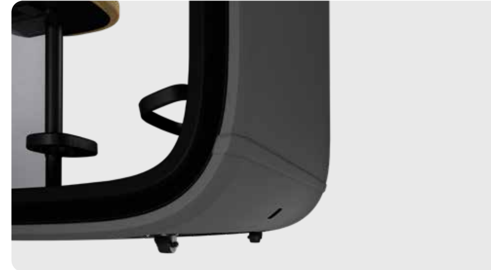
Movability Kit Framery One can be easily relocated without disassembly by lifting the levelling feet up and thus lowering the pod onto its wheels. The high load capacity polyurethane castor wheels are both durable and pliable.

Framery One is UL GREENGUARD GOLD certified