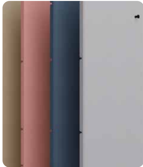
Interior panels Framery One's interior panels come in four different colors. Replaceable interior panels are made from PET sheets which are laminated with polyester fabric.