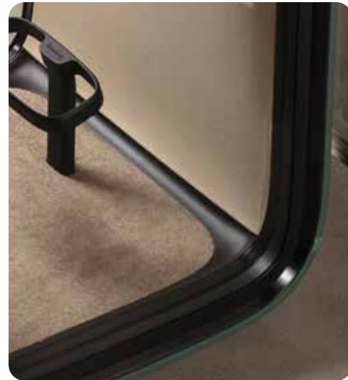
Carpet Framery One's carpet is extremely durable and has excellent acoustic properties while continuing with the soft touch of the interior materials. The carpet is available in four different colors and it's easy to install, remove and clean.