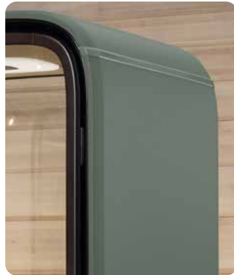
Exterior panels Framery One's powder coated deep-drawn steel panels come in eight carefully selected colors.